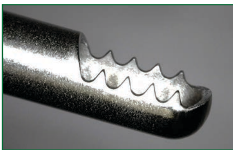
ECG for Burr-Free Grinding Applications