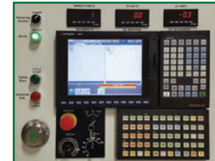
User Interface with Color Screen