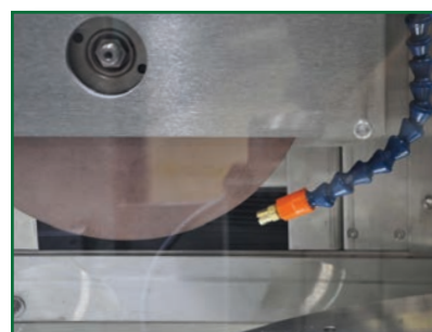
High Precision Spindle