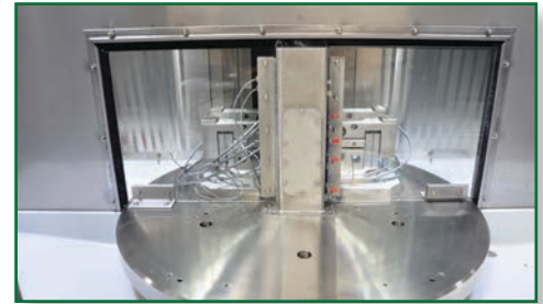
Pallet Changer available for short loading time